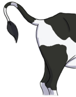
Playful tail position