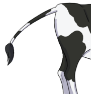
Excited or galloping tail position