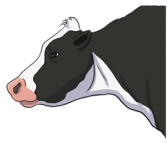
Neutral head position