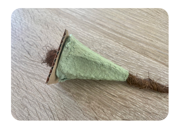
8 Tie toy in your birds' enclosure for them to explore, shred, and enjoy!

6 Thread the rope through the cardboard, then the cone, continuing that pattern.