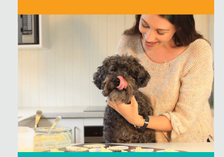
Pupcake Baking: Bake your pup a yum treat!