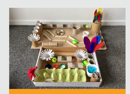
Enrichment Time: Make your companion some