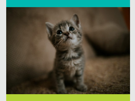
Kind Matters Competition Grab your camera and enter Kind Matters' competition!