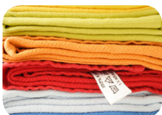
Old/clean towels, blankets and sheets