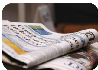
Newspapers (standard size only)