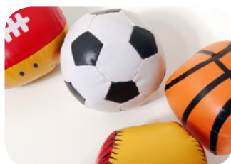
Preloved large sports balls (soccer, rugby)