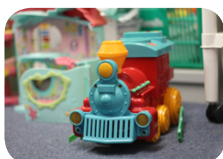
Preloved quality household items suitable to be sold through our SPCA Op Shops

Different SPCA centres may require different things, at different times of the year, so give your local SPCA a call and find out what they need.