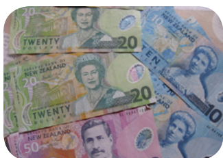
Donations of money